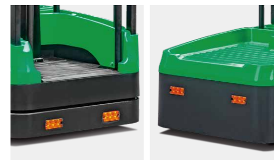
Front and rear flashing lights