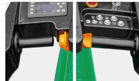
Right and left hand sensing